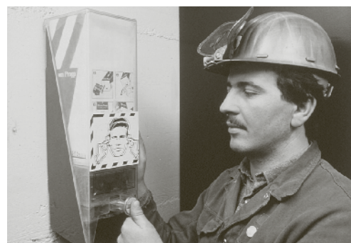
7 Earplug dispenser. Hearing protection products must be easily available at all times.