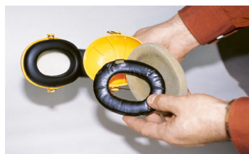
8 Care and maintenance of ear muffs.

The film «Napo – stop that noise!» is ideal for raising awareness and motivating employees. www.suva.ch/laerm >Material >Filme