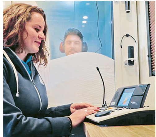
3 Employees under the age of 40, who are exposed to harmful noise, must attend precautionary check-ups in the Suva Audiobile.