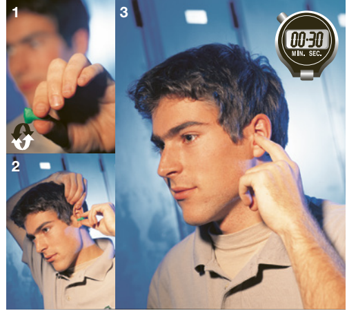
2 Insert ear protection correctly.