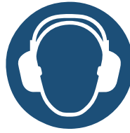
1 Wear ear protection.